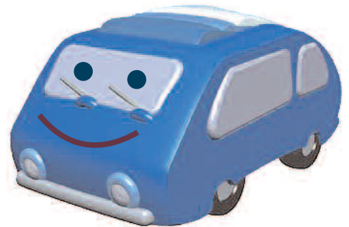
Sheldon as a young car.

If life is a highway as the song says, driving + growing up are totally related. Take me, for instance. I was not always the sleek + cool car you see today (OK, work with me here folks.) On the right you can see a family pic of me as a low-mileage car.